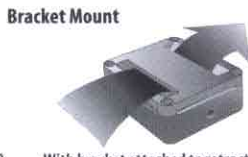
With bracket attached to retractor, slide weight belt through bracket