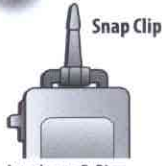
Attaches to D-Ring