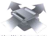
Sandwich webbing between retractor & bracket (horizontally or vertically). Screw bracket to retractor